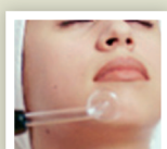
Intensive skin therapy