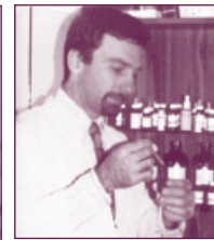
Preparation of Aromatherapy Essential Oil blends